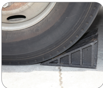
Figure 4: Wheel chocks are in place after parking vehicle.