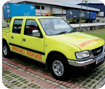
Figure 3: A stand-by vehicle for emergency response purposes.