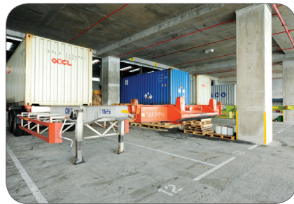
Figure 15: A well-maintained loading or unloading bay that is free of obstruction.