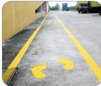
Figure 11: Demarcated pedestrian walkway.