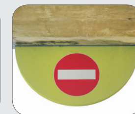
One-way traffic lanes must be marked with a no-entry sign on the exit