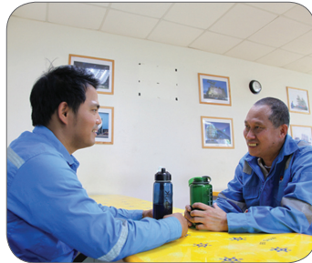
Figure 7: Provide proper rest area.