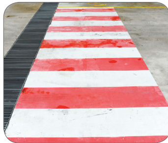
Figure 12: Demarcated pedestrian crossing.