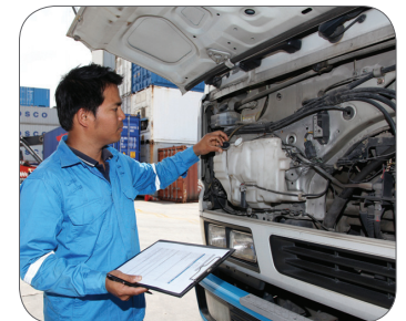
Figure 8: Driver performing daily pre-operational check on vehicle.

A sample daily vehicle checklist can be found at Annex 2 .