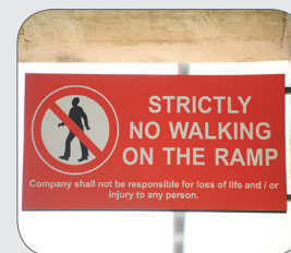
Signage to prohibit pedestrian access