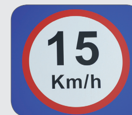
Speed Limit Sign