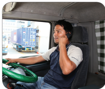
Figure 6: Do not use mobile phone when driving.

The most common distraction for driver is the use of mobile phone while driving (see Figure 6). The use of mobile phone while driving is inconsiderate and dangerous. It distracts a driver from the road and affects a driver's ability to control his vehicle. Drivers should not use mobile phones while driving. Drivers who wish to use their mobile phones should ask their passengers to make or receive calls on their behalf. If driving alone, drivers are advised to stop at the nearest car park to make or answer a call.