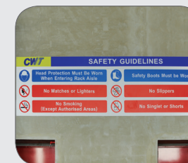
Signages to reinforce safety guidelines