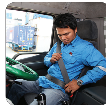
Figure 5: Driver putting on seat belt before driving off.

Tailgating is an act of driving very close to the vehicle in front. It is dangerous because it gives the driver little time to react if the vehicle in front slows down or brakes suddenly. Tailgating may also make the driver in the front vehicle nervous. Vehicles must always be operated at a safe following distance.