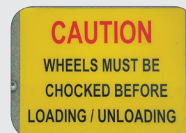
Signage to remind drivers to chock the wheels of their vehicles