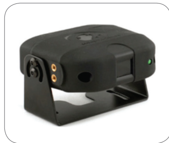
Figure 9: Example of a fatigue management camera.

One example of a driver fatigue management device is the fatigue management camera. This device will monitor a driver's eyelids, head orientation and driver's concentration level. All this information can be downloaded and tracked by a supervisor or management.