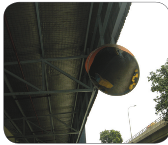
Figure 10: Example of a convex mirror.