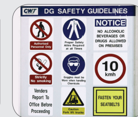
Workplace Traffic or Safety Signs on display