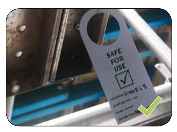
Equipment, such as scaffolds, need to be checked and approved before use.