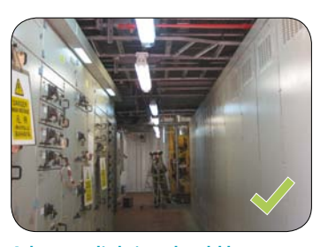
Adequate lighting should be provided for dark areas.