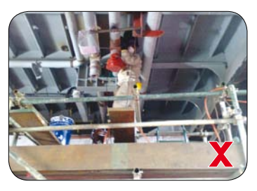
The worker is working on an inadequate working platform and the boards are not secured. He is also not wearing a safety harness.