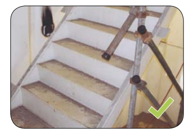
Handrails at open edges of stairway.