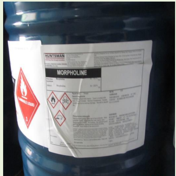
Full GHS label and Dangerous Goods (DG) placard