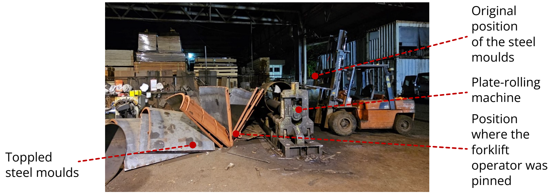
Figure 2: Scene of the accident.

On 18 September 2023, a team of workers was using a plate-rolling machine to fabricate steel pipes. During the fabrication process, a forklift was used to lift a set of steel moulds, each weighing about 200kg, to press down on each newly rolled plate and hold it in place for welding works. When the forklift operator dismounted and moved to the rolling machine, the steel moulds suddenly toppled on him as the moulds were not secured. The forklift operator was sent to the hospital where he died from his injuries.