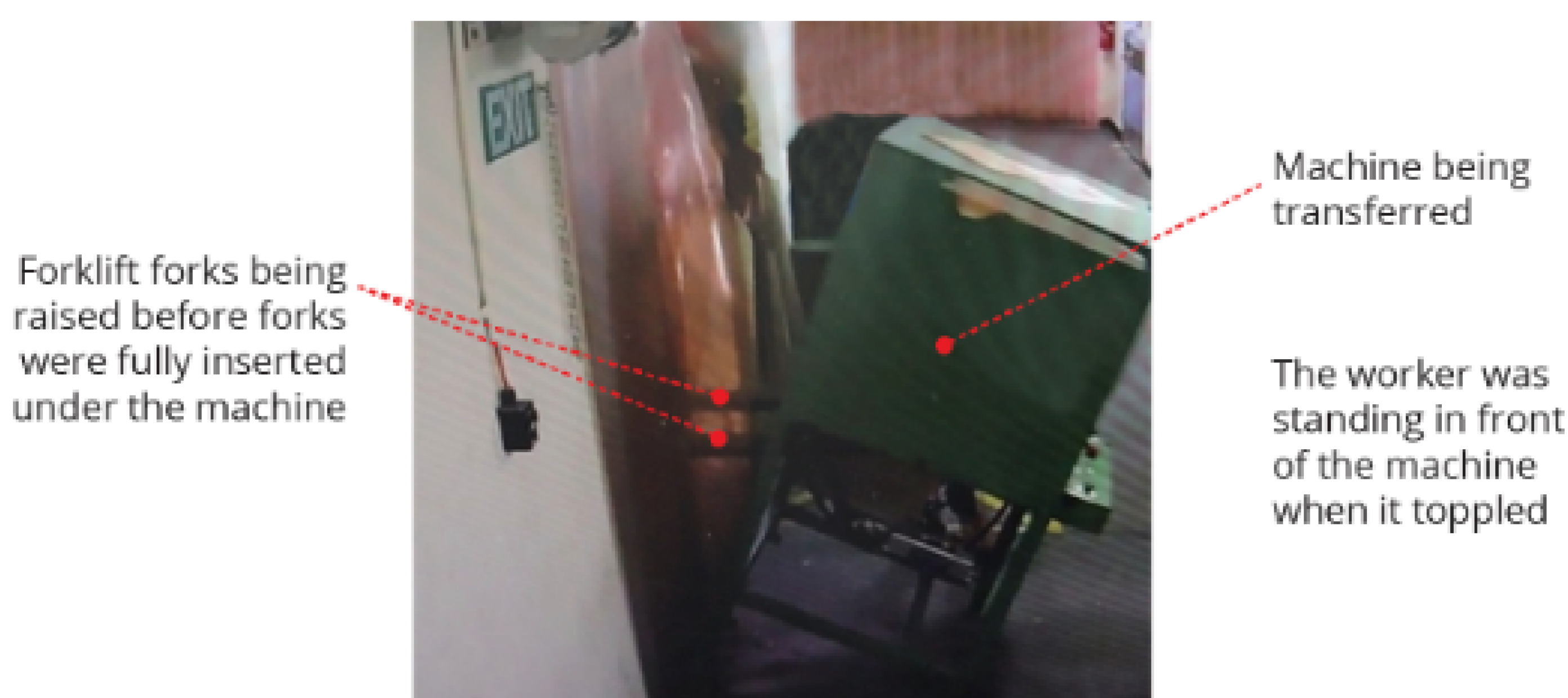
Video capture of the accident.

Preliminary investigation revealed that the forks of the forklift were raised before they were fully inserted under the machine. The lifting of the partially-inserted forks caused the machine to topple.