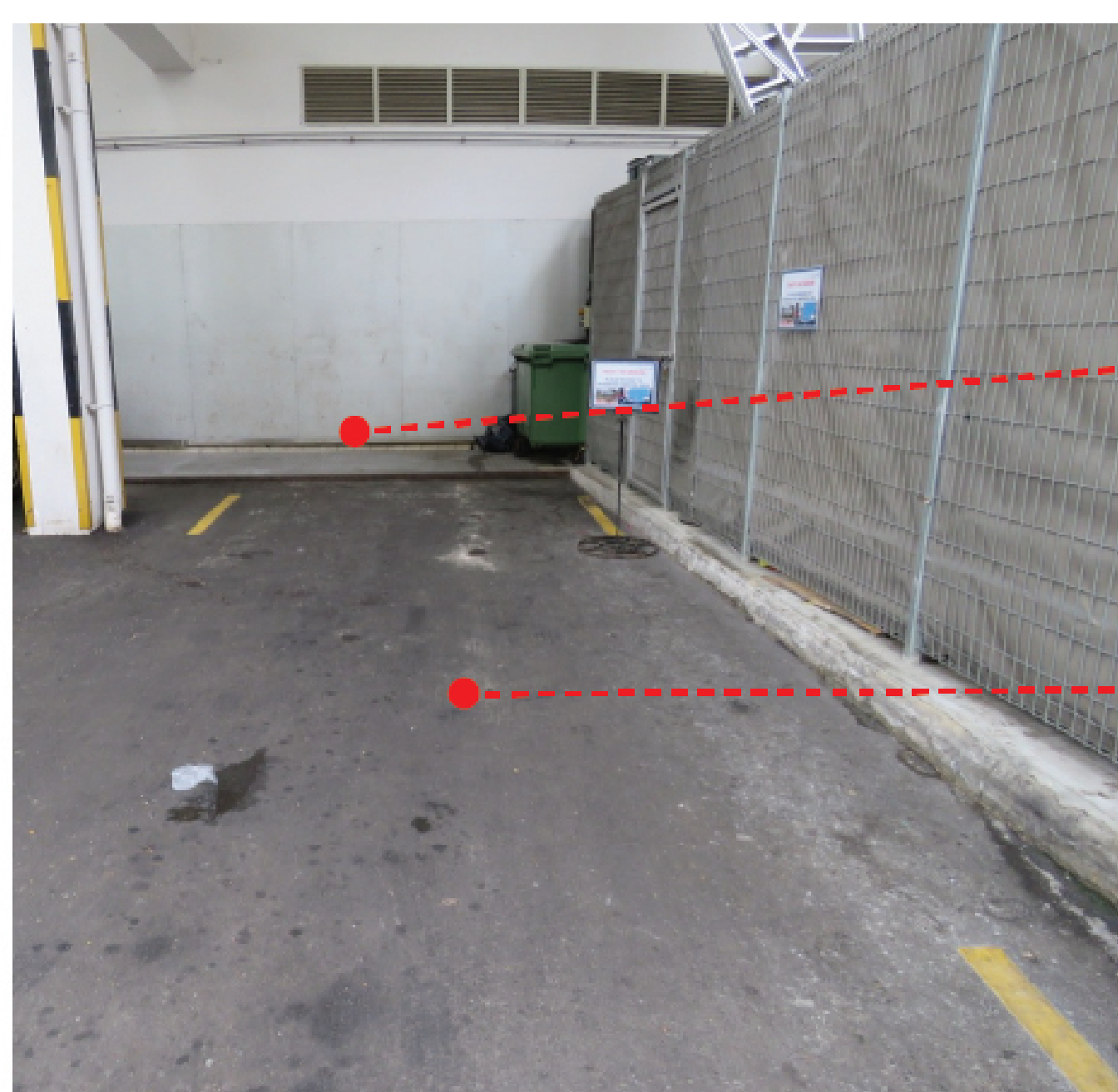
Scene of the accident.

On 5 October 2022, a cleaner was hit by a reversing lorry when he was at a loading/ unloading bay. The cleaner was sent to the hospital where he passed away on the same day.