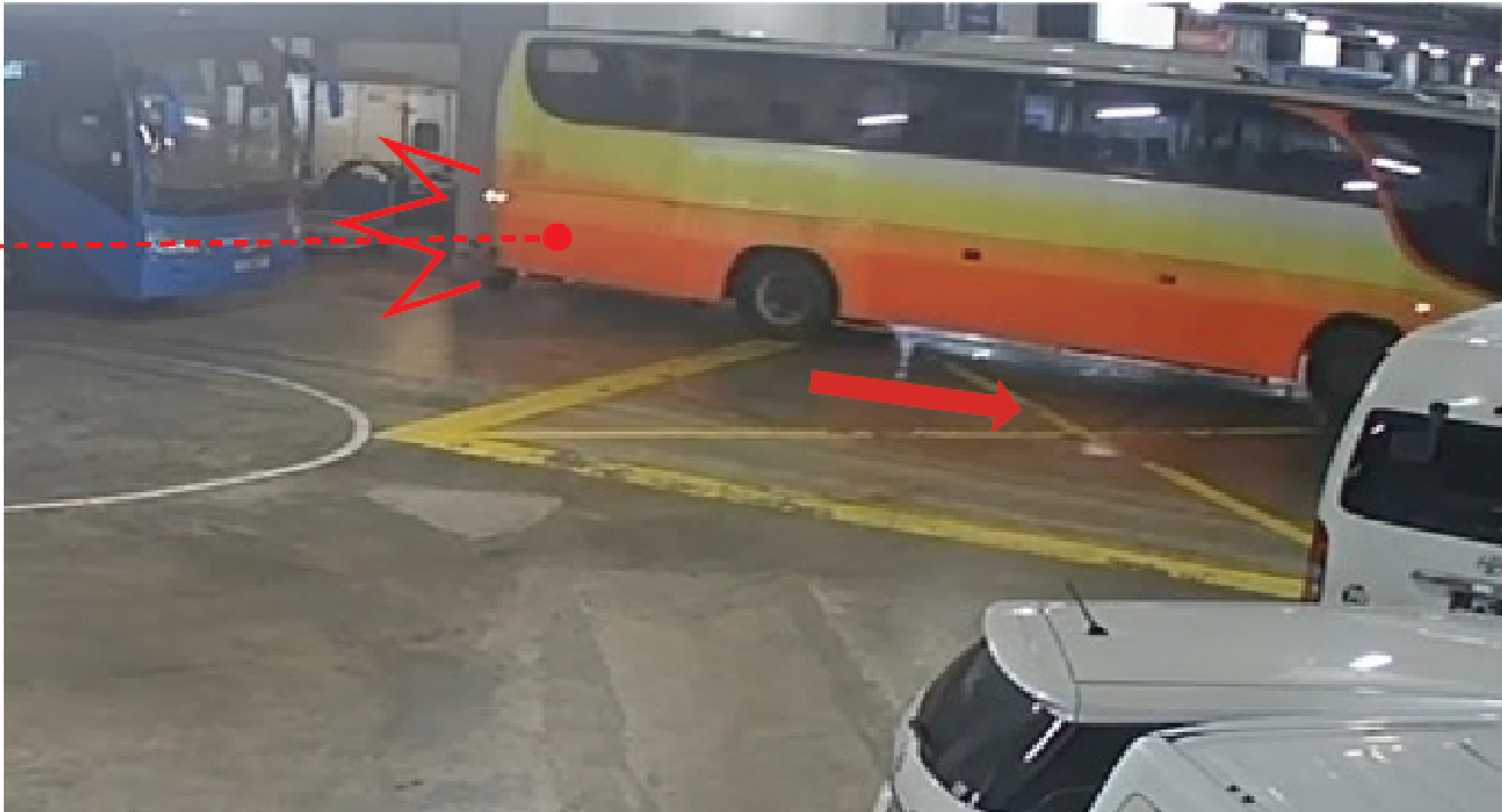
Overview of accident scene.

Worker crushed against the pillar on the left side of the bus when it moved forward