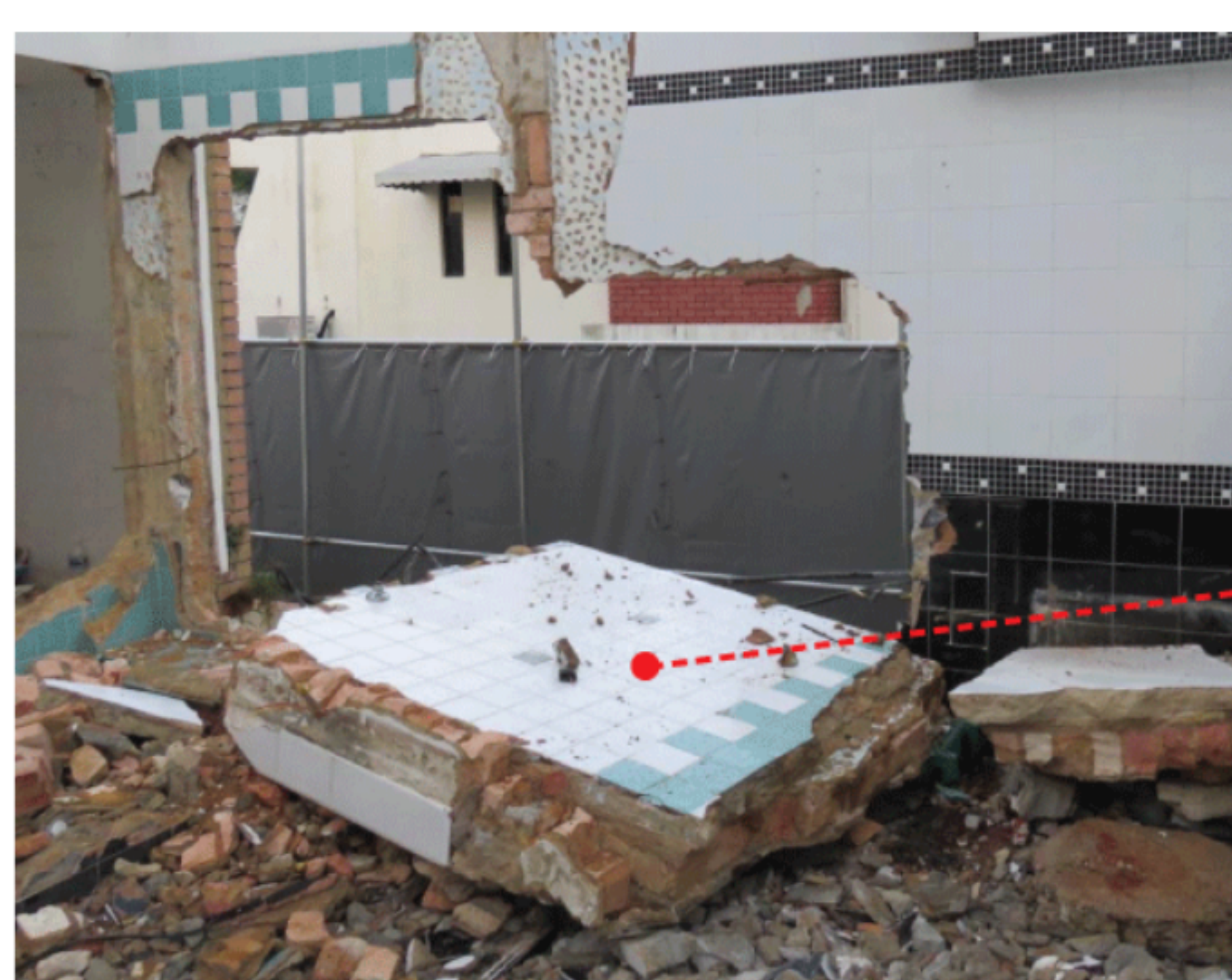
--- Collapsed wall

On 10 June 2022, a worker was hacking a wall on the second storey of a landed private dwelling when it collapsed onto him. He was extricated from the rubble but died soon after.