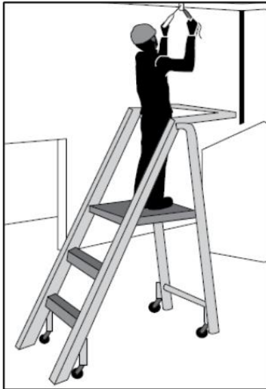
Figure 2: Step Platform