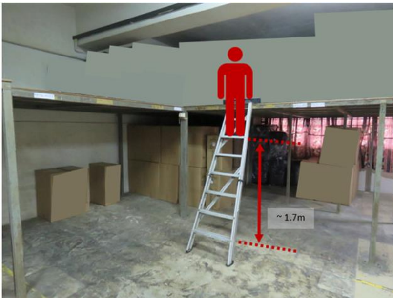
Figure 1: Position of the worker on the ladder just before he fell.

On 24 December 2021, a worker fell about 1.7 metres to the floor when the A-frame ladder he was on slipped. The ladder was leaning against the edge of a mezzanine level and was not secured. The worker struck his head against the floor and succumbed to his injuries three days later.