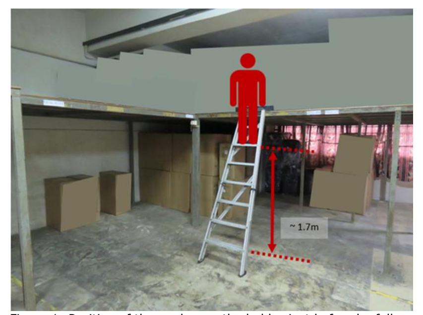
Figure 1: Position of the worker on the ladder just before he fell.

On 24 December 2021, a worker fell about 1.7 metres to the floor when the A-frame ladder he was on slipped. The ladder was leaning against the edge of a mezzanine level and was not secured. The worker struck his head against the floor and succumbed to his injuries three days later.