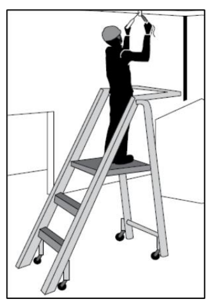
Figure 2: Step Platform