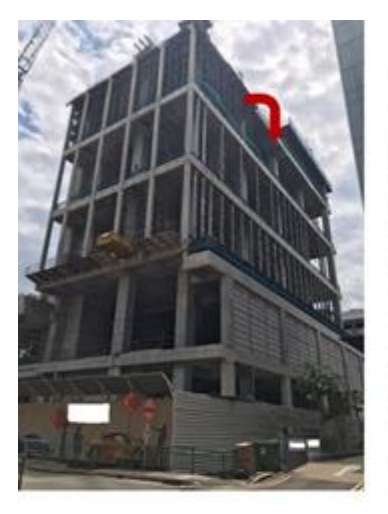
Incident scene (30 July)

Occupiers, employers, principals and tableform manufacturers and suppliers can find out more about the risk control measures that they should adopt to prevent similar incidents in the <u>full article</u>.