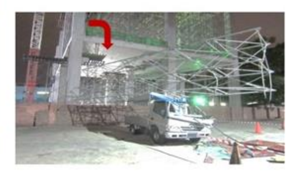
Incident scene (6 August)