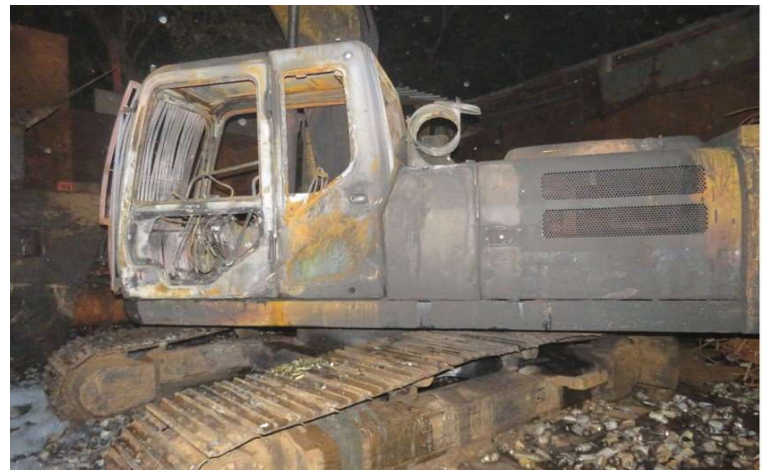
Figure 1: Overview of the accident scene with the burnt excavator

On 24 September 2020, an excavator operator was transferring scrap metal into a compactor when a fire broke out. Shortly after, a co-worker found the operator lying on the ground with burn injuries. The operator subsequently succumbed to his injuries at the hospital on 27 September.