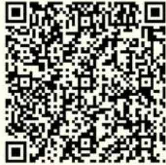
WSH Council's Website