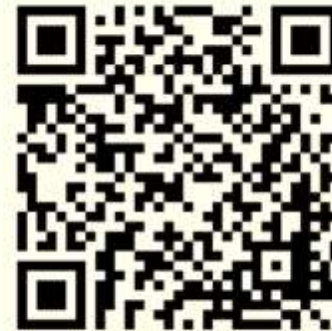
WSH Act and Regulations