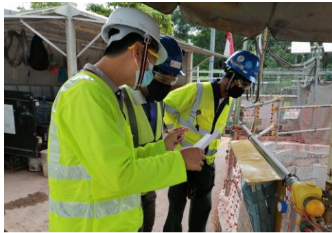
Monthly engagement and audits by top management