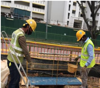
Bridge crossing for a safe means of traversing trenches

CKMbT integrates a holistic approach to its WSH Management Systems from project inception, conducts regular audits and monitors key performance indicators. These efforts result in improved hazard management and productivity. To educate its workers and raise awareness about preventing occupational illnesses, CKMbT initiated a musculoskeletal disease prevention programme.