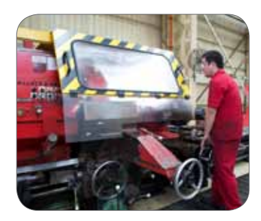
Figure 5: Example of an engineering control: Machine guarding installed on moving part of machine.

These reduce exposure to a hazard by adherence to procedures or instructions. Documentation should emphasise all the steps to be taken and the controls to be used in carrying out the work activity safely. Permitto-work (PTW) system, scheduling of incompatible works and SWPs are examples of administrative controls.