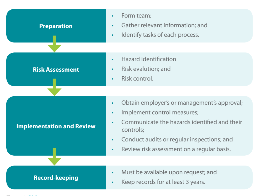
Figure 2: Risk management process.

WSH Risk Management (RM) is a systematic way to identify, assess, control and monitor WSH risks associated with any work activity or trade, and to communicate these risks to employees, contractors and other relevant parties (see Figure 2).