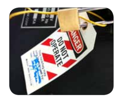
Figure 8: Machine locked-out and tagged-out for maintenance.

SWPs and controls should be reviewed on a regular basis to evaluate their relevance and effectiveness. Refer to Annex 5 for details on the types of WSH practices and controls that should be established at the workplace.