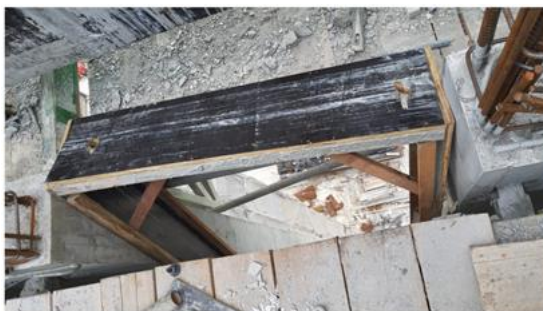
Structure used to bridge the gap.