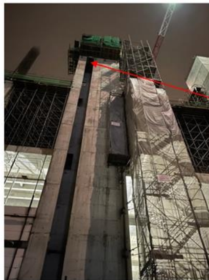
Overview of the accident scene.

On 10 June 2021, a worker fell 40 metres to his death through a gap in the floor of a warehouse building under construction. The structure used to cover the gap gave way when the worker was crossing the structure. The worker was wearing a full body harness without a lanyard attached.