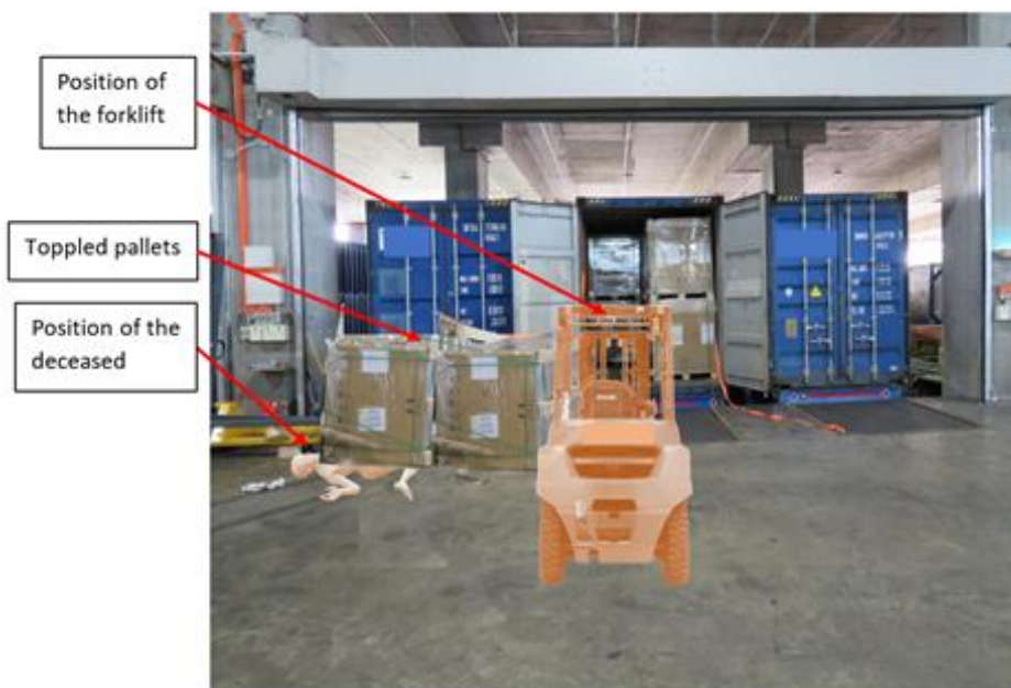
Overview of accident scene.

The unconscious operator was later conveyed to the hospital where he succumbed to his injuries.