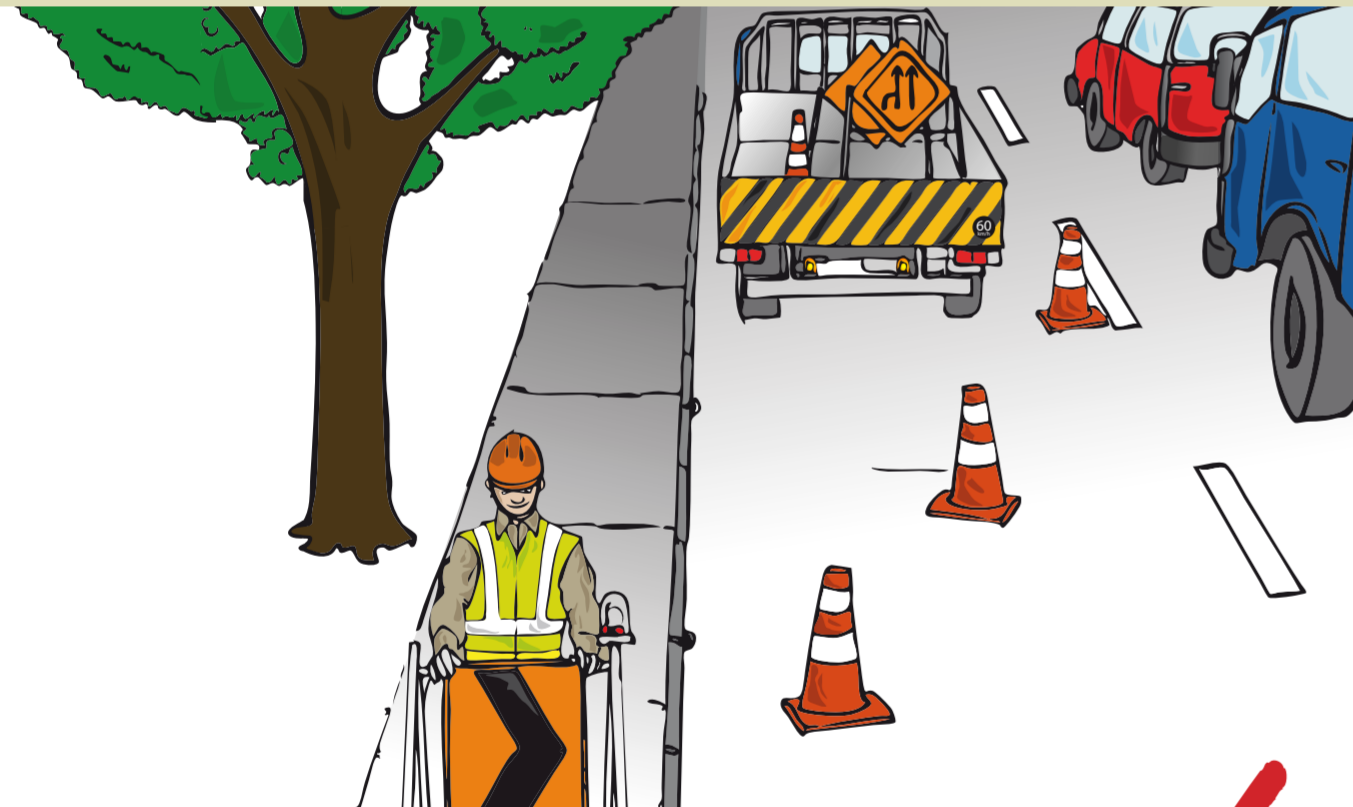
Place warning signs before securing the work zone.