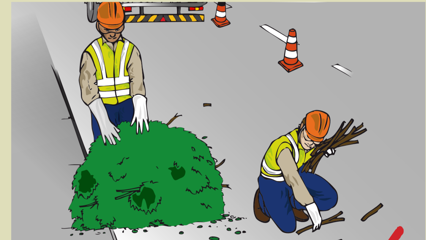
Wear reflective vests when working along the road.