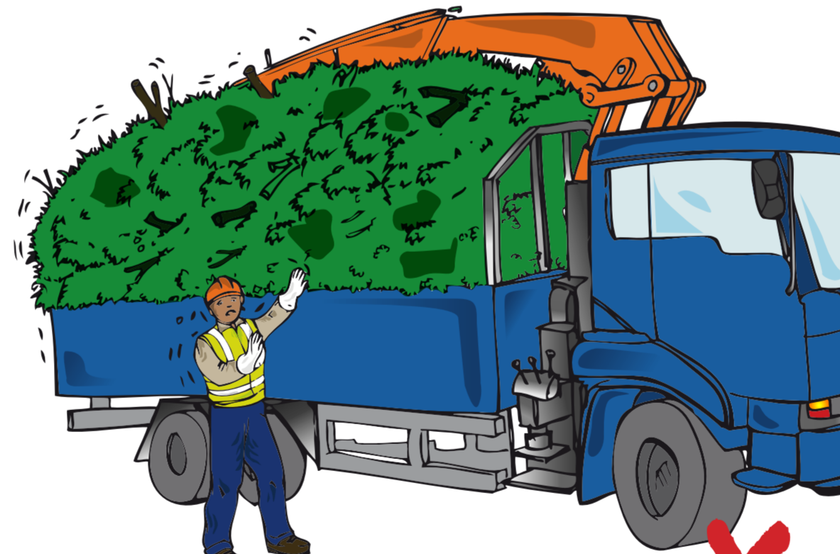
DO NOT overload the vehicle and secure all loose debris.