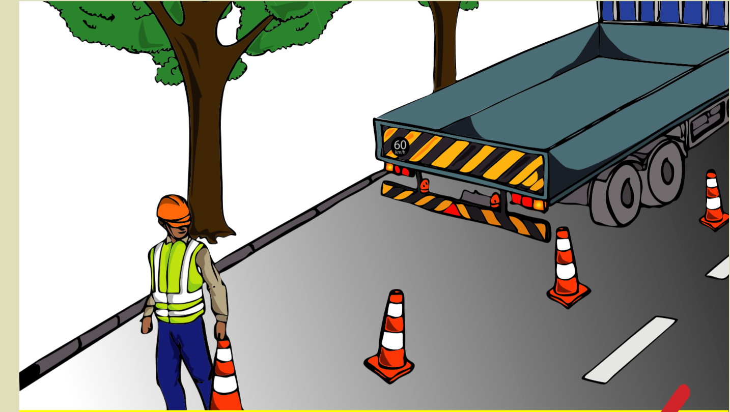
Secure the work zone before working along the road.