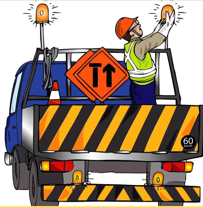
Place a blinking beacon on the top and rear of the vehicle.