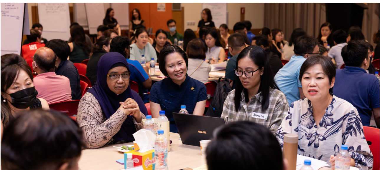
MOS Gan attending a dialogue session with employees on 11 October 2023.