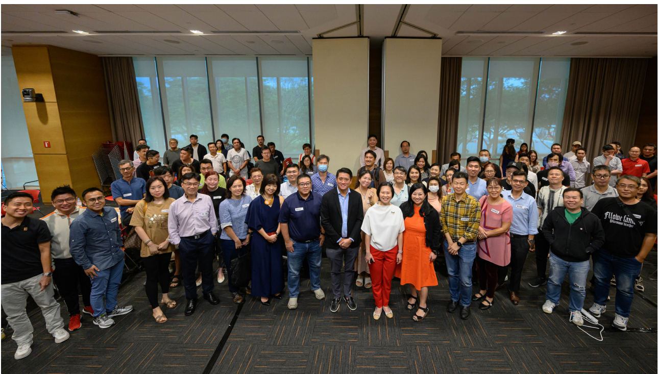
Engagement with employers on 24 October 2023.