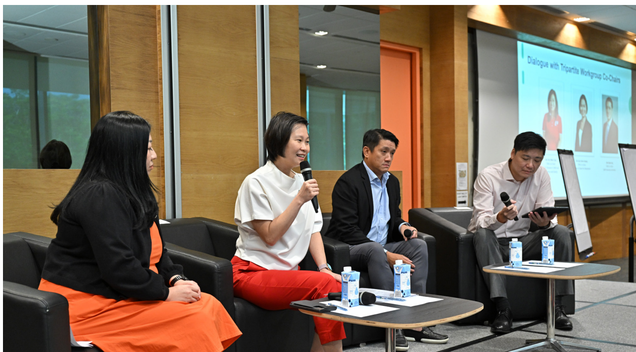
The Workgroup Co-Chairs attending an engagement with employers on 24 October 2023.

3.8.2. Nevertheless, the Workgroup recognises that the administrative requirements under the TG-FWAR should be kept light, with supporting resources to help employers adhere to the TG-FWAR. This way, a balance can be achieved between helping all employers gain greater access to manpower, and minimising administrative burden.