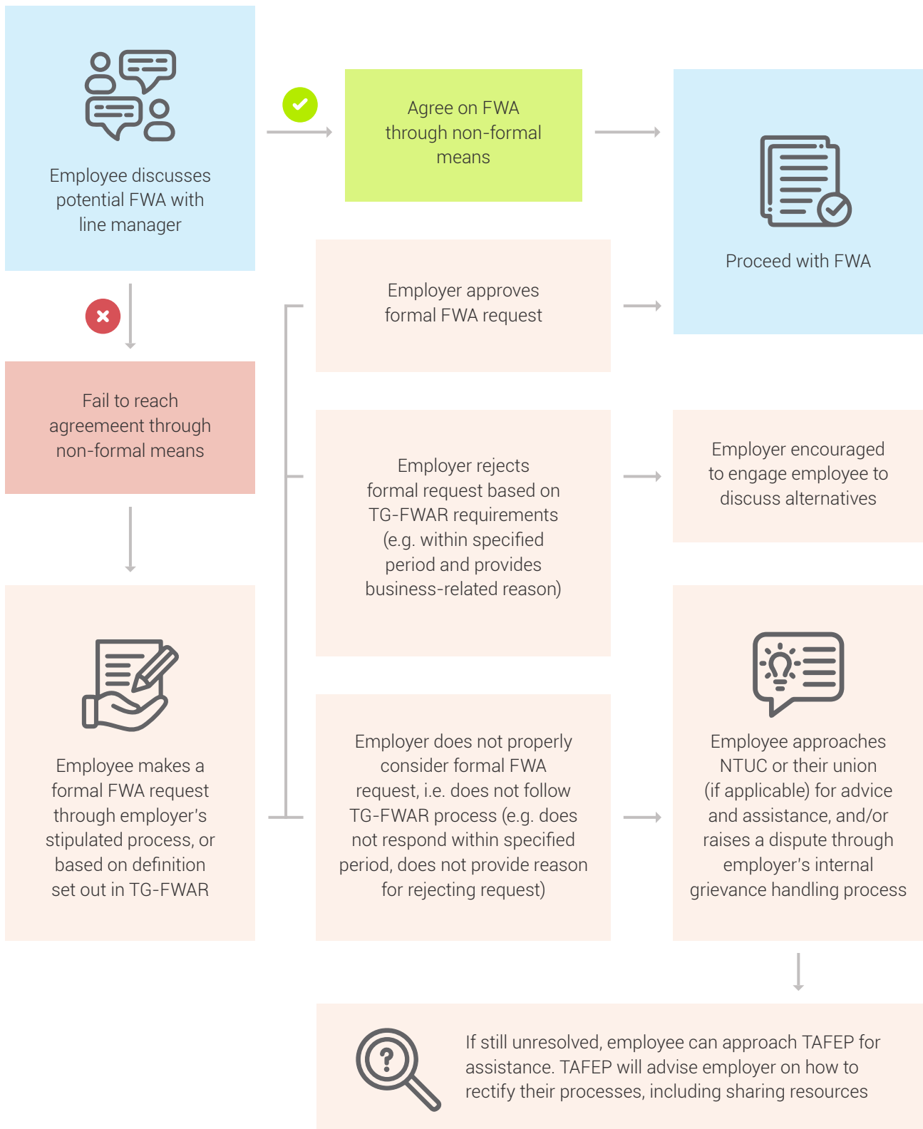
Figure 4.1: Recommended Approach to Managing Complaints under TG-FWAR

4.1.4. As the TG-FWAR will guide the process of requesting FWAs and not the outcomes of FWA requests, TAFEP will not arbitrate on outcomes of requests. Figure 4.1 describes the recommended approach for managing complaints under the TG-FWAR.