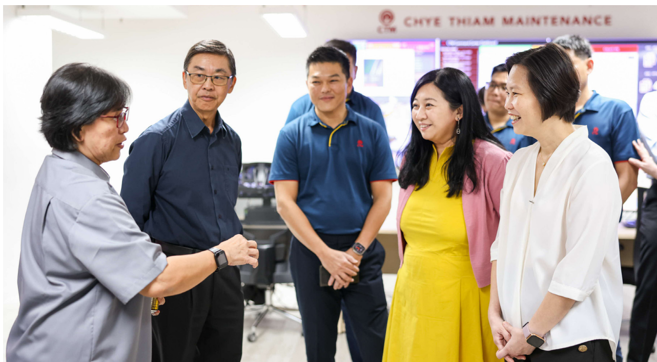
Visit to Chye Thiam Maintenance Pte Ltd on 28 November 2023.