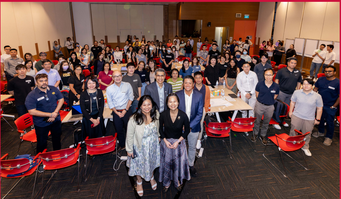
Focus group discussion with employees on 11 October 2023.