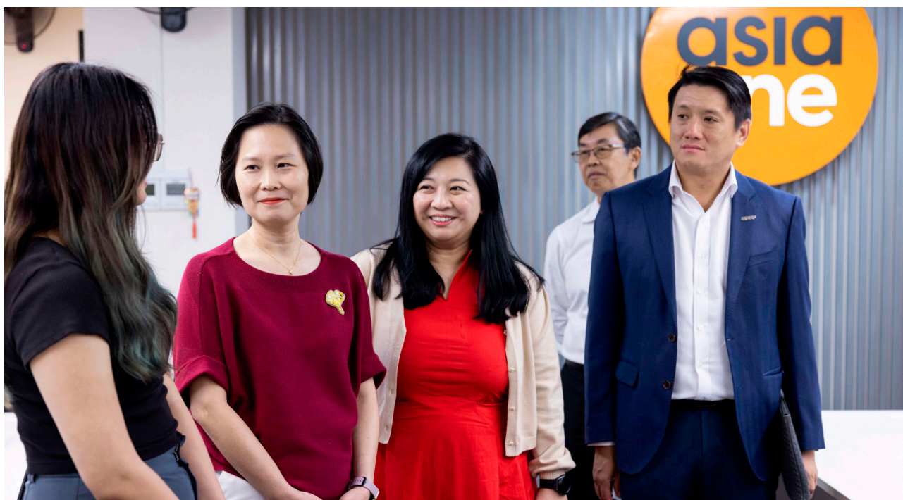
The Workgroup Co-Chairs visiting AsiaOne on 31 January 2024.

3.5.2. The TG-FWAR should instead focus on facilitating effective communication through formal FWA requests, to help employers who do not have such practices in place. Formal requests should be documented to ensure each party's considerations are clearly communicated to the other.