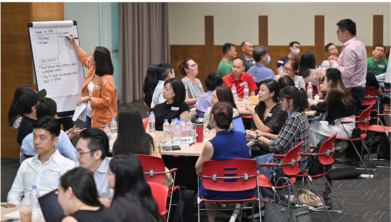
Focus group discussion with employers on 24 October 2023.