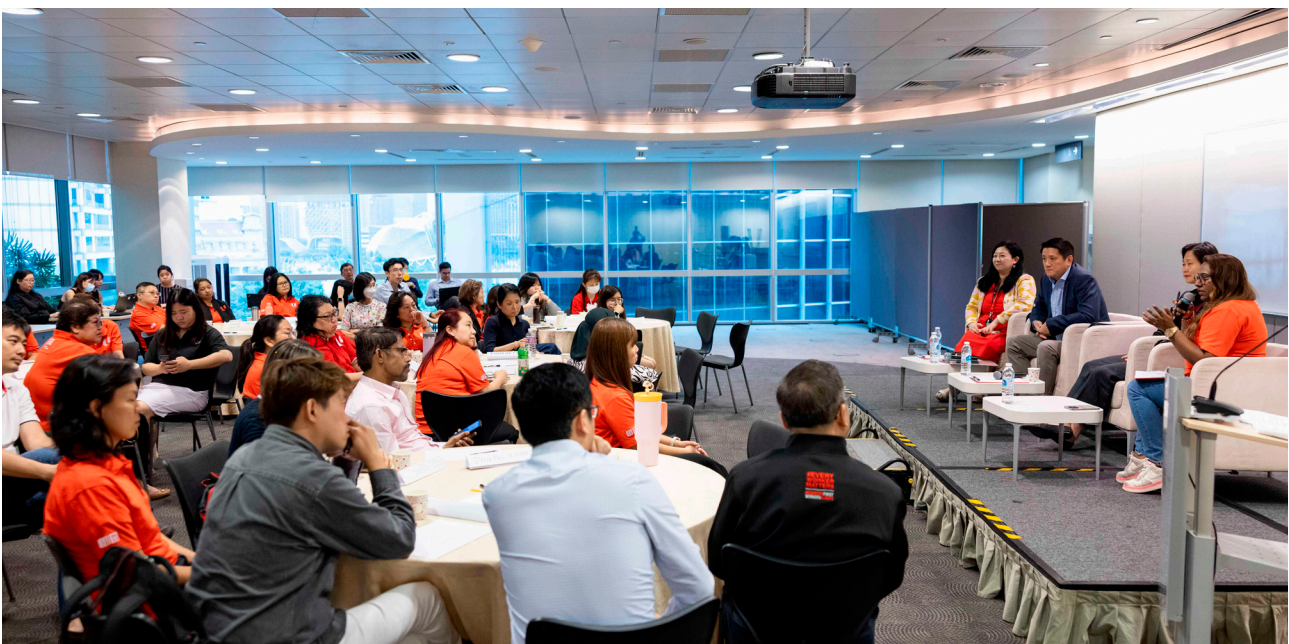
Dialogue session with union representatives on 23 January 2024.

5.1.2. Employers are also concerned that FWAs will hurt productivity by reducing employees' ability to meet key performance indicators, making it difficult for teams to collaborate, or requiring changes to manpower allocations. These concerns are not insurmountable. FWAs can be compatible with high productivity if employers and HR practitioners have good understanding of the suitability of different types of FWAs for their particular industry and job role, and possess the knowledge and skills for effective FWA implementation.