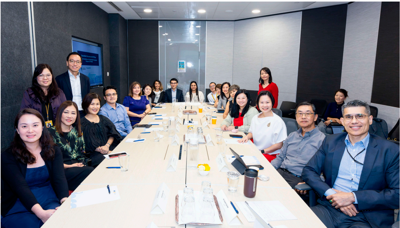
Roundtable discussion with human resource practitioners on 16 January 2024, organised by the Institute for Human Resource Professionals.